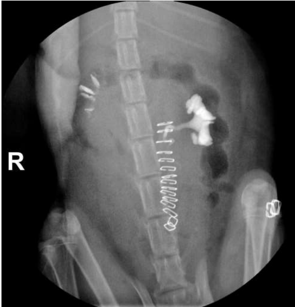
Bilateral pyelography demonstrating bilateral hydronephrosis, failure of opacification of entire right ureter and distal left ureter. Skin staples are present along the ventral midline and left flank from previous ovariohysterectomy procedure.