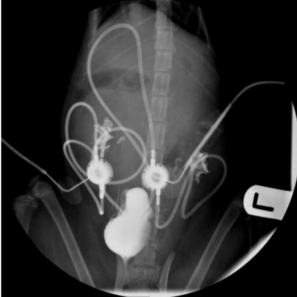
Fluoroscopy with iohexol injection into SUB ports reveals patent bilateral SUBs and normal ureters.