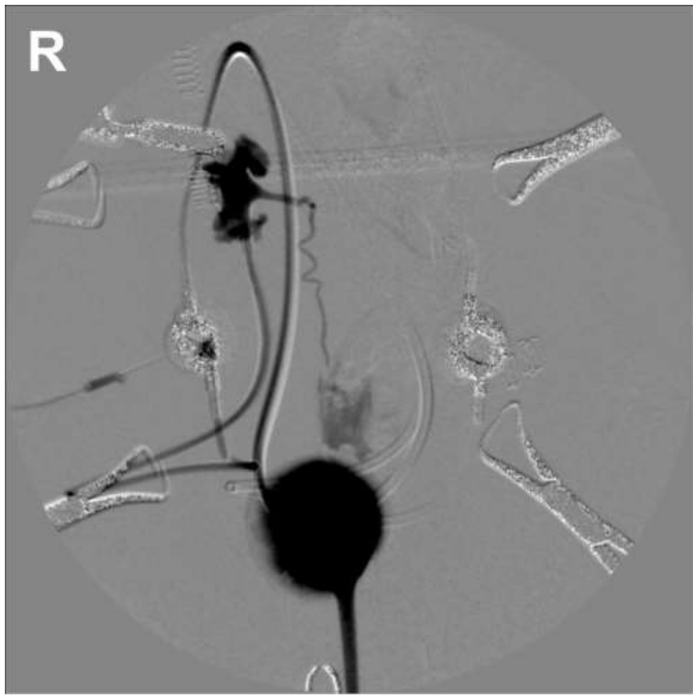
Fluoroscopy with negative subtraction and iohexol injection into right SUB port reveals right hydronephrosis and contrast leak from the mid right ureter.

1 2 3 4 5 6 7 8 9 10 11 12 13 14 15 16 17 18 19 20 21 22 23 24 25 26 27 28 29 30 31 32 33 34 35 36 37 38 39 40 41 42 43 44 45 46 47 48 49 50 51 52 53 54 55 56 57 58 59 60